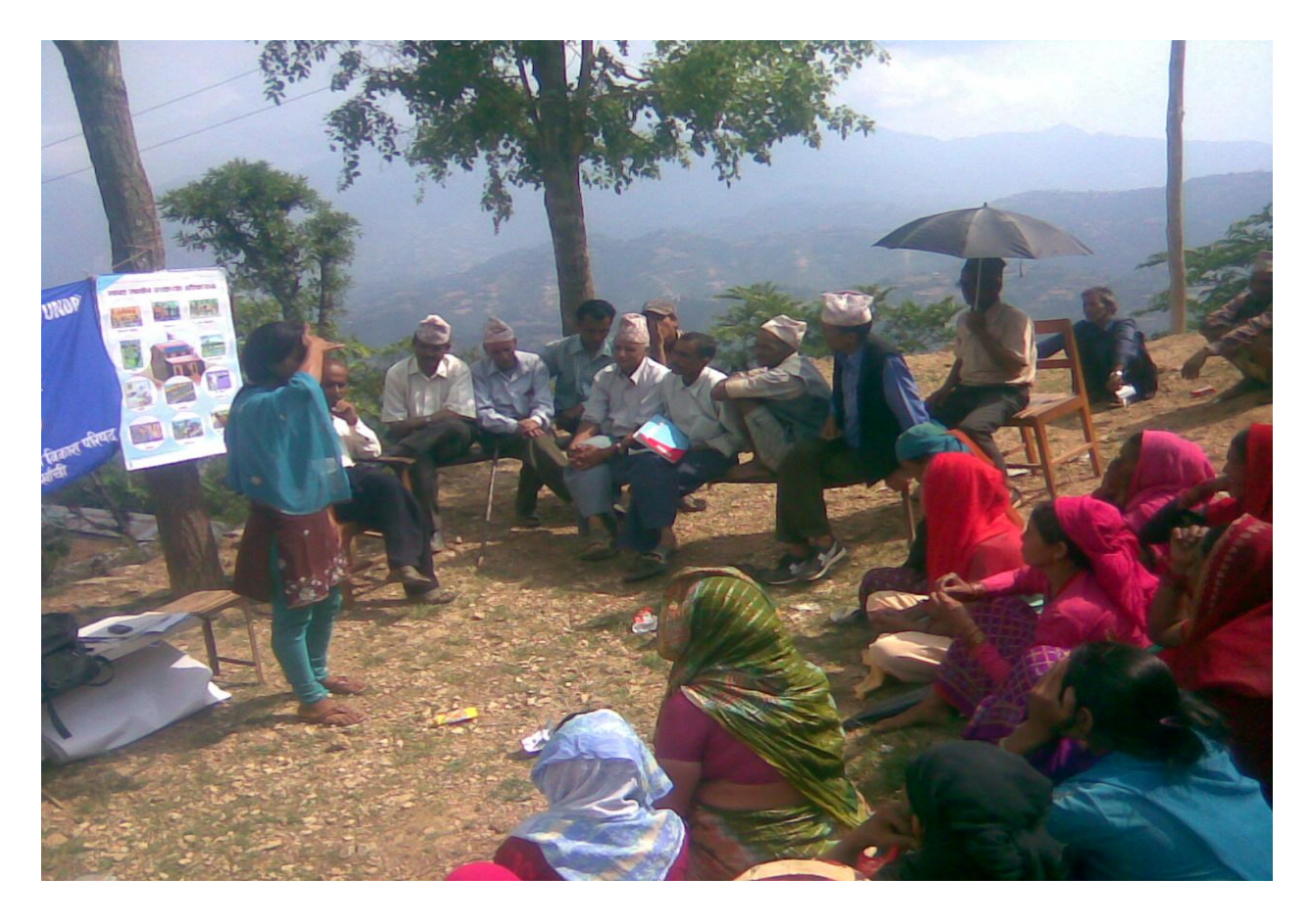
(Participants of VDC level democratic dialogue held at Arghakhanchi district)